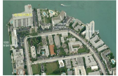
Built in 1966 - 168 units - 11 floors

Manager: 305-864-8296 & IslandPointeManager@gmail.com