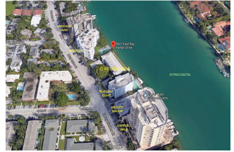
Built in 2017 - 41 units - 9 floors

O Residences 9821 E. Bay Harbor Drive, Bay Harbor, Miami, 33154 info@obayharbor.com (786) 275-6035