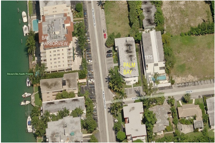
Built in 1956 - 12 units - 2 floors