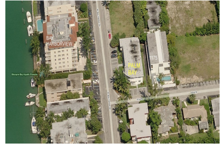
Built in 1956 - 12 units - 2 floors