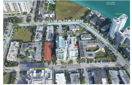
Built in 2018 - 42 units - 8 floors

The Palms Residences 305.864.3777 info@thepalmsresidences.com http://thepalmsresidences.com/