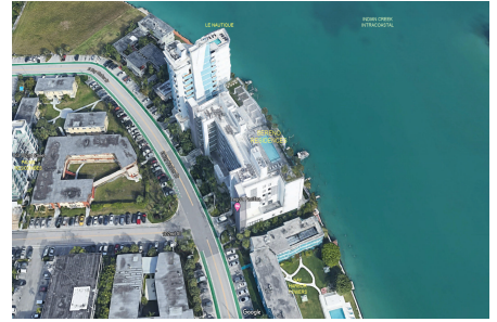
Built in 2016 - 38 units - 7 floors

Sereno 10201 E Bay Harbor Dr Bay Harbor Islands, Florida 33154 +1 786-725-3646