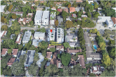
Built in 2021 - 8 units - 3 floors