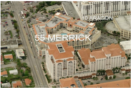
Built in 2008 - 166 units - 8 floors

55 Merrick Condominium Association, Inc 305-445-4205