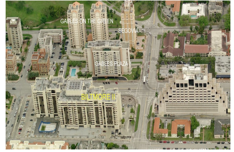
Built in 1973 - 232 units - 13 floors