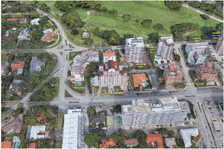
Built in 1990 - 23 units - 14 floors

Biltmore Regent Condominium Address: 721 Biltmore Way, Coral Gables, FL 33134 Phone: +1 305-444-4674