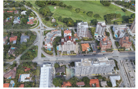
Built in 1990 - 23 units - 14 floors

Biltmore Regent Condominium Address: 721 Biltmore Way, Coral Gables, FL 33134 Phone: +1 305-444-4674