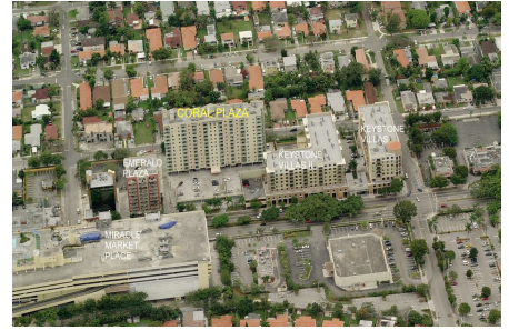
Built in 2002 - 180 units - 15 floors