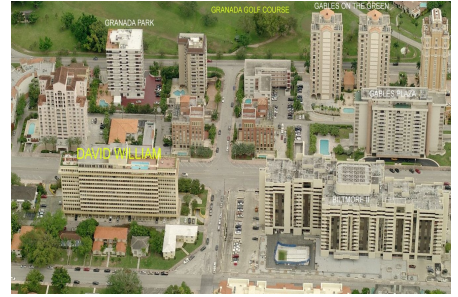
Built in 1963 - 195 units - 12 floors

David William Condominium Association 305-529-9050 & info@dwcondo.com property manager : manager@dwcondo.com http://www.dwcondo.com/