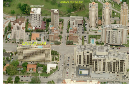
Built in 1963 - 195 units - 12 floors

David William Condominium Association 305-529-9050 & info@dwcondo.com property manager : manager@dwcondo.com http://www.dwcondo.com/