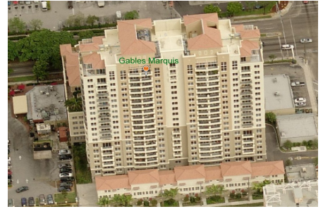
Built in 2007 - 180 units - 20 floors

Gables Marquis condominium (305) 461-0039 & (305) 567-3097