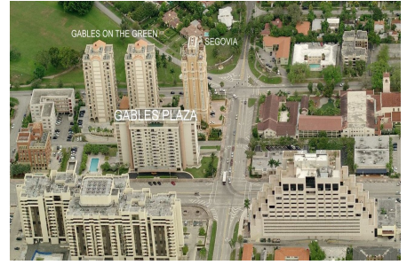
Built in 1969 - 90 units - 15 floors