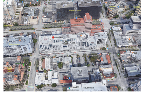
Built in 2018 - 33 units - 9 floors

Giralda Place Residences Address: 275 Giralda Ave, Coral Gables, FL 33134 Phone: +1 305-445-1662 http://giraldaplace.com/