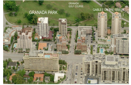
Built in 1982 - 32 units - 14 floors