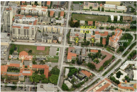
Built in 1987 - 15 units - 5 floors

Majorca Plaza Condominium Association (305) 446-4163