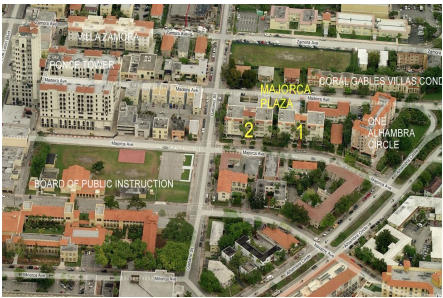
Built in 1989 - 16 units - 5 floors

Majorca Plaza Condominium Association (305) 446-4163