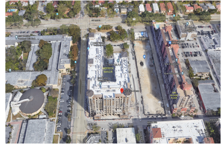
Built in 2019 - 227 units - 10 floors

Merrick Manor Address: 301 Altara Ave, Coral Gables, FL 33146 Phone: +1 305-779-6870 https://www.merrick-manor.com/