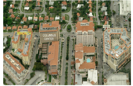
Built in 2005 - 119 units - 8 floors

The Minorca Condominium Association (305) 476-1780