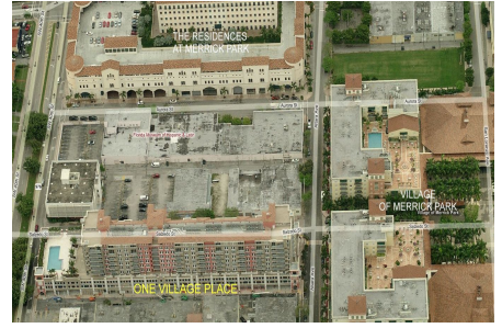
Built in 2008 - 126 units - 10 floors