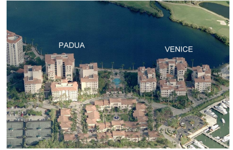
Built in 1995 - 54 units - 9 floors