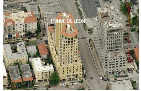
Built in 2008 - 70 units - 14 floors