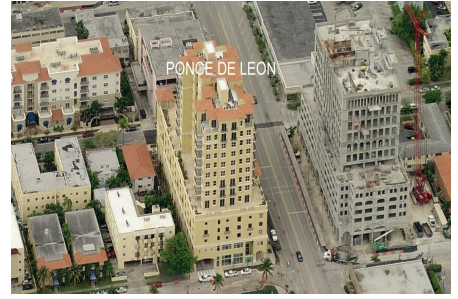
Built in 2008 - 70 units - 14 floors