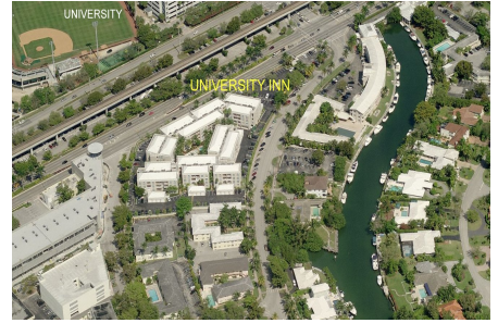
Built in 1990 - 146 units - 4 floors

University Inn Condominium Association (305) 661-6255