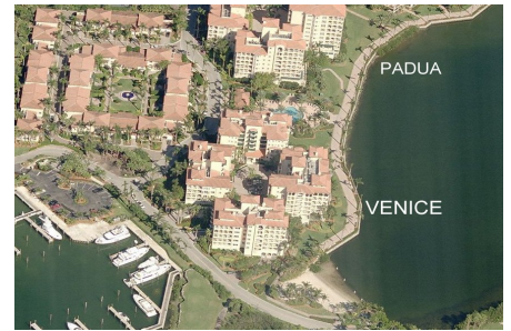
Built in 1993 - 44 units - 7 Floors