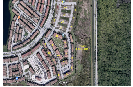
Built in 2007 - 148 units - 2 floors

The Courts at Bayshore 22711 SW 88th Pl, Cutler Bay, FL 33190 (877) 876-6980