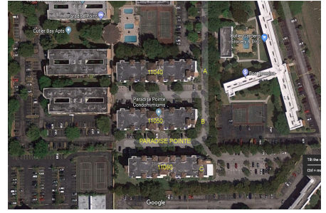
Built in 2005 - 190 units - 6 floors

Paradise Point Condominium Association 11050 Sw 196th Street Cutler Bay, FL 33157 Phone: (305) 253-0971 (305) 252-6637