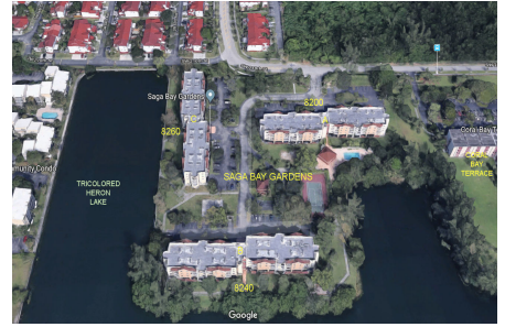
Built in 1988 - 180 units - 3 floors

SAGA BAY HOMEOWNERS WEBSITE Harbor Management Services, Inc. Community Plaza, 15600 SW 288 Street, Suite 406 Miami, FL, 33033 Phone: (305) 246-5867, FAX: (305) 245-8020 http://www.sagabayhoa.com/