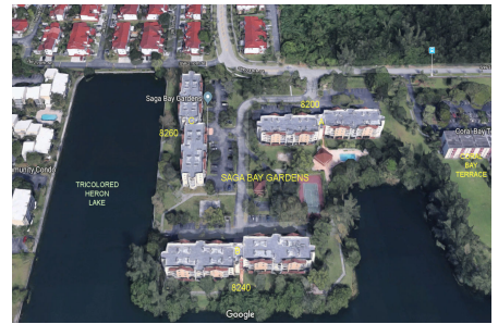
Built in 1988 - 180 units - 3 floors

Harbor Management Services, Inc. Community Plaza, 15600 SW 288 Street, Suite 406 Miami, FL, 33033 Phone: (305) 246-5867, FAX: (305) 245-8020 http://www.sagabayhoa.com/