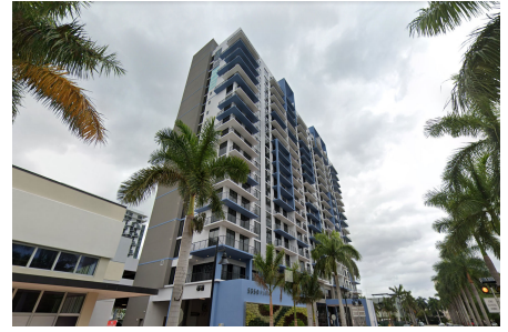
Built in 2019 - 238 units - 20 floors