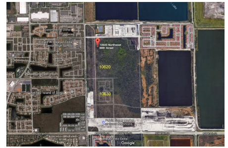
Built in 2015 - 111 units - 3 floors