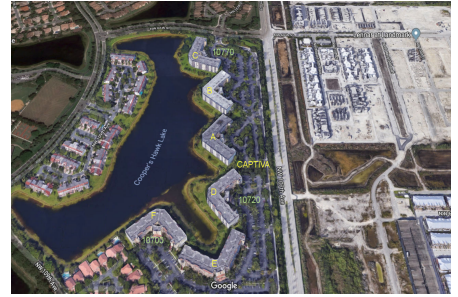
Built in 2000 - 70 units - 5 floors

Doral Isles Community Association Address: 6450 NW 110th Ave, Doral, FL 33178 Phone: +1 305-436-0912