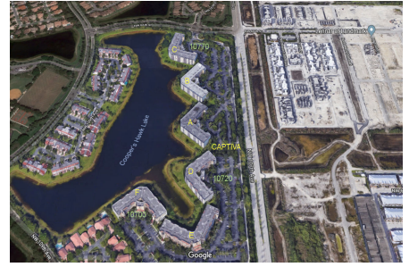
Built in 2001 - 70 units - 5 floors

Doral Isles Community Association Address: 6450 NW 110th Ave, Doral, FL 33178, Phone: +1 305-436-0912