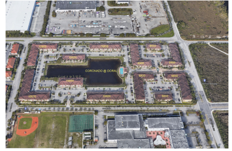
Built in 2007/2010 - 328 units - 3 floors

Coronado at Doral Address: 8900 NW 107th Ct, Doral, FL 33178 Phone: +1 786-235-4800 https://www.coronadoatdoral.com/home/