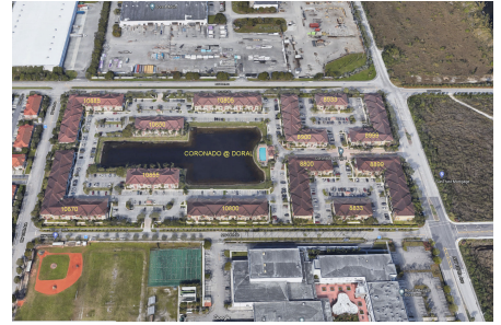
Built in 2007/2010 - 328 units - 3 floors

Coronado at Doral Address: 8900 NW 107th Ct, Doral, FL 33178 Phone: +1 786-235-4800 https://www.coronadoatdoral.com/home/