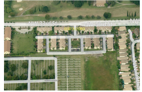
Built in 1998 - 52 units - 2 floors