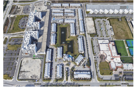
Built in 2013 - 158 units - 2 floors

Doral Cay Address: 10451 NW 58th St, Doral, FL 33178 Phone: +1 305-715-7117