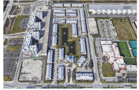
Built in 2013 - 158 units - 2 floors

Doral Cay Address: 10451 NW 58th St, Doral, FL 33178 Phone: +1 305-715-7117