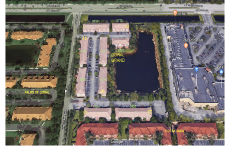
Built in 2000 - 76 units - 2 floors

Doral Grand Condominium, Inc 5901 NW 151st Street # 100 Miami Lakes, FL 33014 Phone: (305) 817-9012