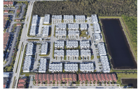
Built in 2016 - 142 units - 2 floors

Doral Palms 5630 NW 102 Ave Doral, FL 33178 (305) 471-0208 Management Company (786)-310-5261 https://www.doralpalms.com/