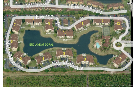
built in 1998 - 258 units - 3 floors

Enclave At Doral Master Association 4300 NW 107th Ave Doral, FL 33178 (305) 477-7870