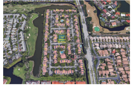
Built in 1990 - 440 units - 2 floors

The Greens At Doral Address: 4630 NW 97th Ct, Doral, FL 33178, Phone Number: 305-883-5681 x 112 Email Address: management@thegreensatdoral.com http://www.renovationspm.com/thegreensatdoral/