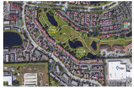
Built in 1981 - 185 units - 2 floors

Indian Summer Village Condo Assn Inc 279 West Park Drive Miami, FL 33172 Phone: (305) 485-9500