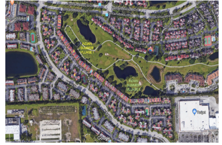
Built in 1981 - 185 units - 2 floors

Indian Summer Village Condo Assn Inc 279 West Park Drive Miami, FL 33172 Phone: (305) 485-9500