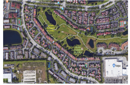
Built in 1984 - 146 units - 2 floors

Indian Summer Village II Condo Association Inc 415 West Park Drive Miami, FL 33172 Phone: (305) 496-0182