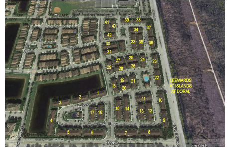
Built in 2005 - 340 units - 2 floors