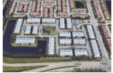
Built in 2010 - 123 units - 2 floors