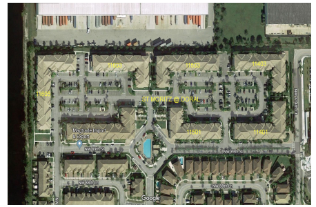
Built in 2011 - 207 units - 2 floors