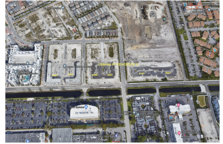
Built in 2022 - 226 units - 4 floors

Number of units: 226 Number of active listings for rent: 15 Number of active listings for sale: 16 Building inventory for sale: 7% Number of sales over the last 12 months: 15 Number of sales over the last 6 months: 6 Number of sales over the last 3 months: 3 Urbana Midrise Condominium Residences Address: 4745 NW 84th Ct, Doral, FL 33166, https://websites.mmlive.net/urbananeighborhood