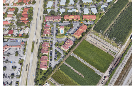
Built in 2000 - 78 units - 2 floors

VILLA ENCANTADA MASTER HOMEOWNERS ASSOCIATION, INC. c/o CARIBBEAN PROPERTY MGMT 12301 SW 132ND CT MIAMI, FL 33186 Phone: +1 305-251-3848