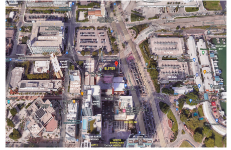
Built in 2022 - 646 units - 47 floors

The Elser Residences Miami Address: 398 NE 5th St, Miami, FL 33132 Phone: +1 305-744-5842