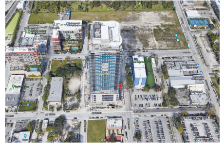
Built in 2018 - 513 units - 37 floors