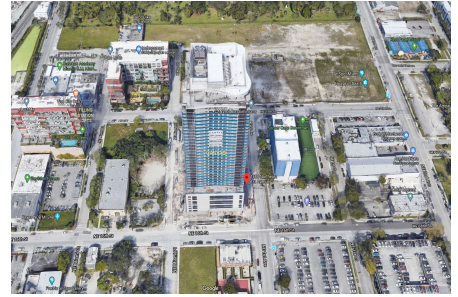
Built in 2018 - 513 units - 37 floors