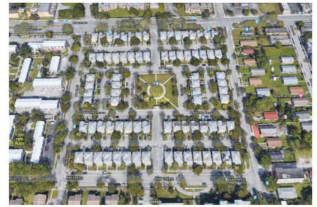
Built in 2006 - 80 units - 2 floors