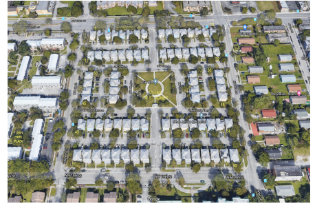
Built in 2006 - 80 units - 2 floors