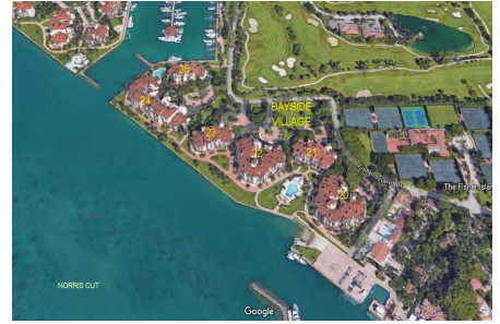
Built in 1986 - 110 units - 4 floors

Bayside Village Condominium Association 2400 Fisher Island Dr Miami, FL 33125 Phone number (305) 695-0470