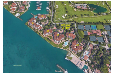
Built in 1986 - 110 units - 4 floors

Bayside Village Condominium Association 2400 Fisher Island Dr Miami, FL 33125 Phone number (305) 695-0470