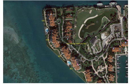
Built in 1991 - 96 units - 7 floors

Fisher Island Community Association Address: 1 Fisher Island Dr, Miami Beach, FL 33109 Phone: +1 305-535-6000 https://www.fisherislandfica.com/